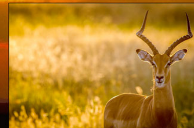
2 TROPHY IMPALA