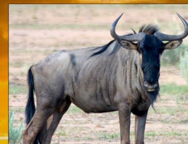
2 TROPHY WILDEBEEST

All airfare, taxidermy & shipping, pre- and post-safari lodgings, all personal expenses, gratuities, hard liquor, and any additional activities like golf, Victoria Falls & Kruger National Park trips.